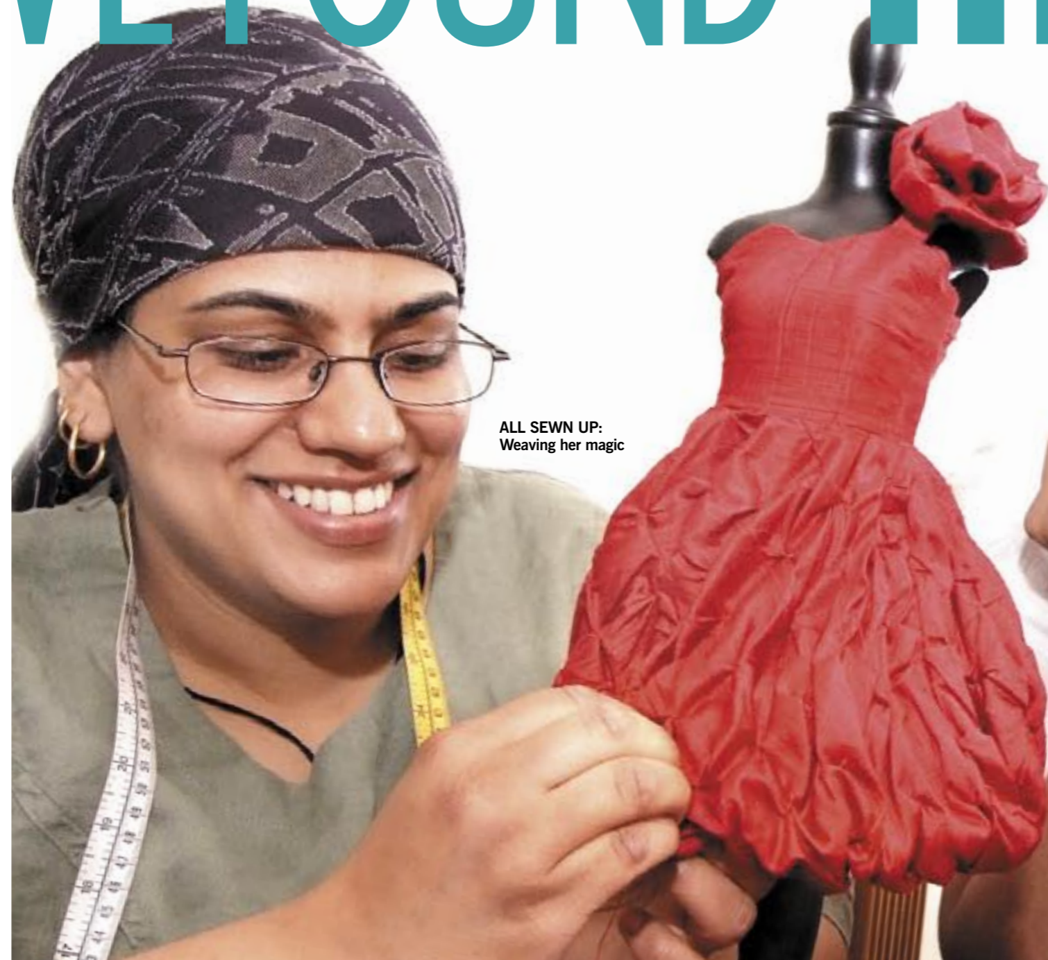
ALL SEWN UP: Weaving her magic